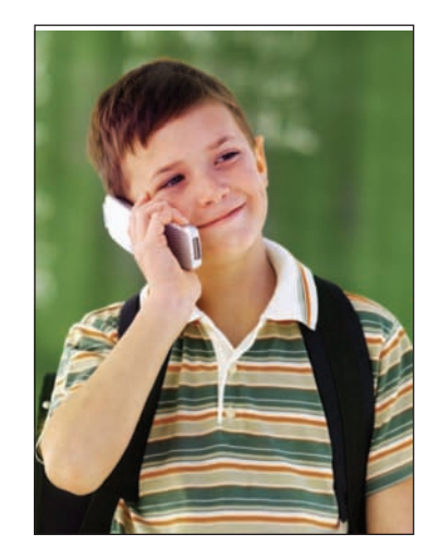
Review studies note that insufficient time has passed to evaluate long-term risks associated with slow-growing brain tumors, but some studies already show possible evidence of an increased risk of brain tumors from the use of cell phones.