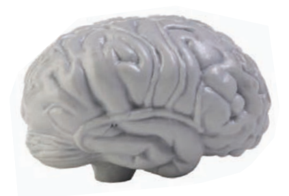
In 2011, IARC classified radiofrequency electromagnetic fields (RF-EMFs) as possibly carcinogenic to humans, citing an increased risk of glioma associated with wireless phone use.